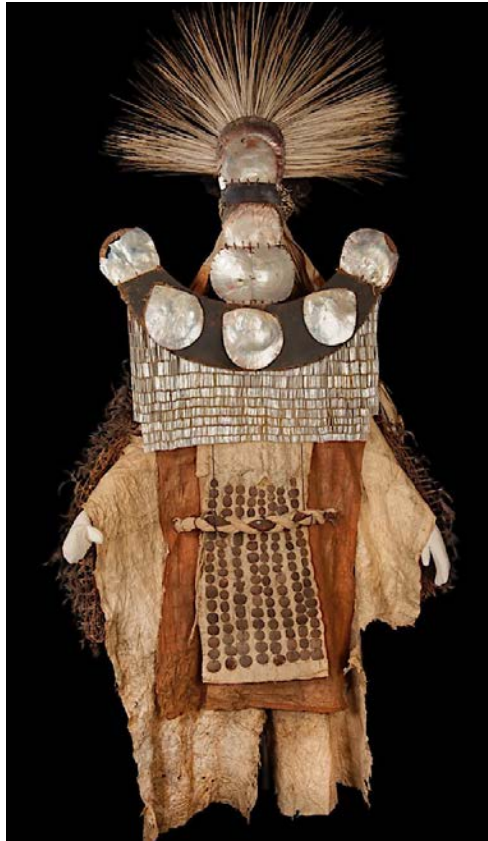
Mourning dress from Tahiti collected on Cook's 2nd voyage, 1772-4. It incorporates wood, sea shells and turtle shells. The mask is bound with braided human hair, a reminder of the unbroken chain of ancestors. (1886.1.1637)

Subject indexes for bound volumes and webpages are different. The former can be long because book pages are easy to scan, but each screen holds less material than a page and no viewer wants to scroll through screen after screen. Indexes can of course be linked to a searchable alphabet, but this only helps if searchers know their precise search word, and few do. Making a web-accessible index therefore