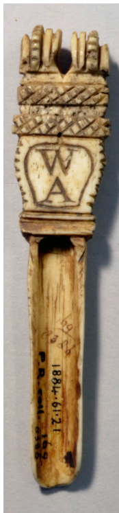
Fig. 1: 1884.61.21 apple gouge, London 1829