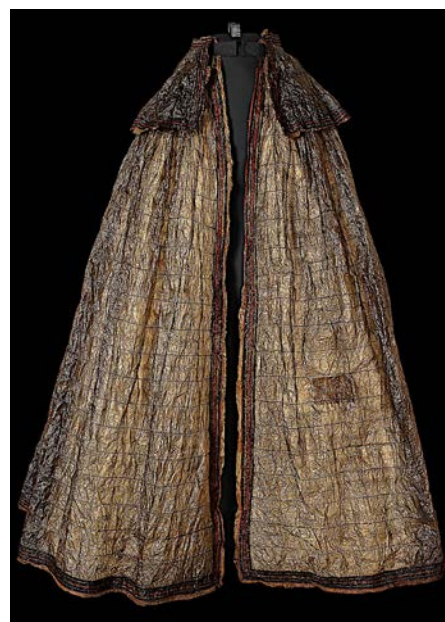
Hand-sewn, decorated cloak made of seal intestines from the Aleutian Islands. (1886.1.871)

means producing something that is easy and intuitive to use, and for this the indexer has to see themselves as a user.