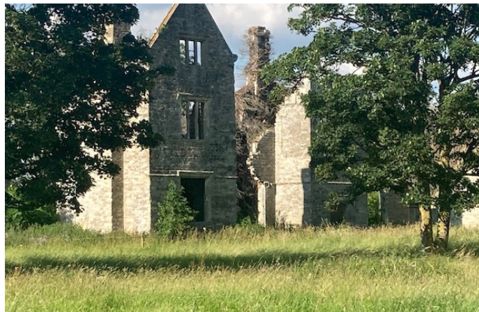
The ruins of Hampton Gay Manor.