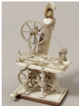
Fig. 3: 1945.2.3 model of woman at a spinning wheel, UK