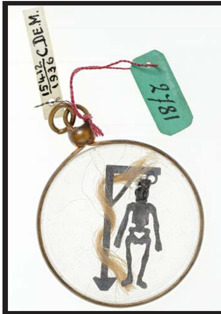
Hangman Locket, France (1985.52.1359)

The Museum is a space that broadly speaks about what it means to be human. It is no surprise that there are display cases and collections that touch on different aspects of health and medicine, alongside research and display projects such as 2019's 'Messy Realities', which focused in on museum collections and contemporary medical technologies. Disease, medicine and general wellbeing can be schematised through objects and displays in all sorts of ways, from the large 'Sanni' (demon) mask of eighteen demons, representing eighteen diseases, used in healing ceremonies, through to the very small objects of amuletic protection, which can be carried