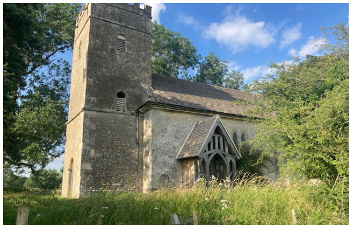
St Giles Church, Hampton Gay.

A few miles north of Oxford outside Kidlington, on the River Cherwell, lies the almost deserted estate of Hampton Gay. The shadowy ruins of its burnt down Elizabethan manor house often feature in photography blogs. Hampton Gay is sometimes described as a 'lost village' or DMV (Deserted Mediaeval Village). However, it is not among the 3000 listed DMVs on Historic England's website, perhaps because a few dwellings remain.