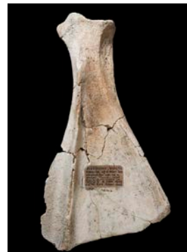
Fig. 4: 1926.50.3 shovel from scapula, Avebury, Wiltshire 2900 - 2600 BC