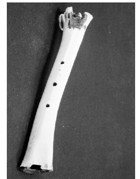
Fig. 5: 1931.13.1 flute, Guyana