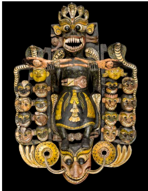
Mask of Demons of Disease, Sri Lanka (1899.88.1)