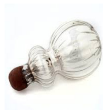
Witch in a bottle 1926.6.1.

This co-curated exhibition is about queer lived experiences, putting the voices of LGBTIAQ+ communities at the heart, connecting their voices to you.