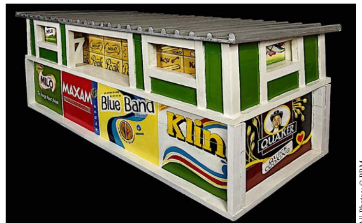
Coffin for a shopkeeper made at the Kane Kwei Coffin Workshop in Accra, Ghana (2010.68.1)