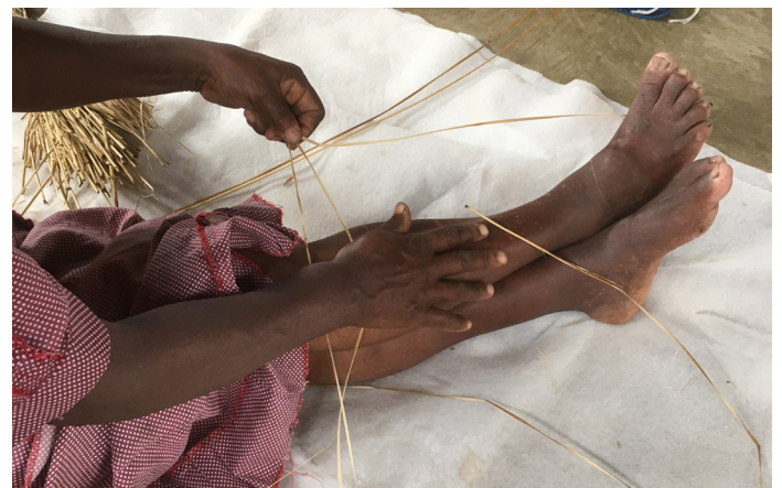
Plying the three strands on lower leg

The plied strands were threaded on a cord made from the discarded pith, using a blunt-ended wooden needle made for the purpose. When all were threaded, the needle then returned to the starting point to begin a second row, thus gradually forming a tubular structure, forming the mouth of the strainer. Round and round the needle went, as the tube grew, narrowing gradually as the shorter rush stems