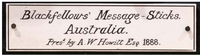
Label in the Writing and Communications case using outdated language, PRM, 2021

During the Labelling Matters project's review of PRM interpretation, I came across two major streams of problematic language: the overtly offensive/derogatory and the euphemistic. The former is often situated within the more historic labelling and easier to identify. The latter, however, is much more prevalent throughout all labelling and requires a lot more critical unpicking and self-reflexivity.