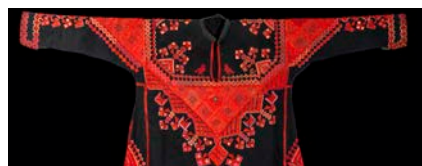
Womens thob. (2018.37.18) PRM