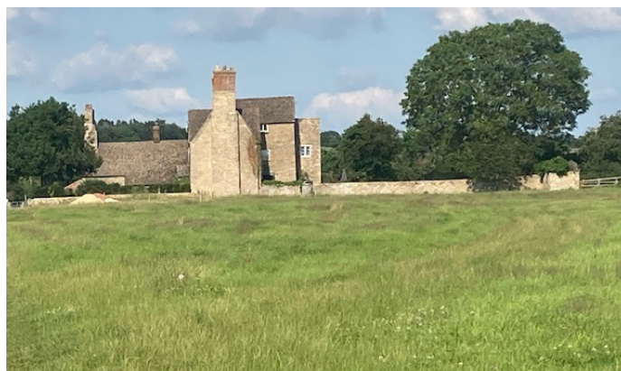
Manor Farm today.