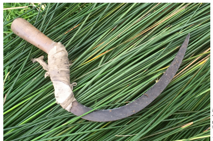
Freshly collected rush on river bank with collecting tool