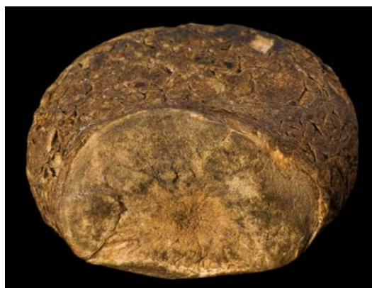
Potato used as a cure for rheumatism (1897.83.3)