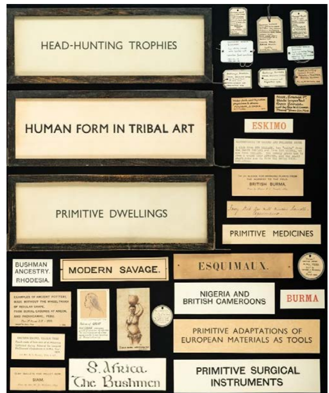
Historic labels no longer on display at PRM. 2021.