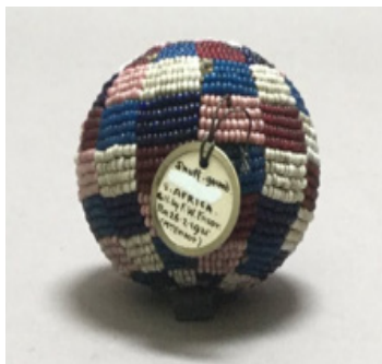
Beaded snuff gourd from South Africa with offensive ethnonym Tippexed out. PRM

The euphemistic problematic labels are often not overtly offensive or even technically incorrect, but their silences, omissions and wordplay uphold entrenched stereotypes and colonial ideologies. For example, two labels refer to two Asian textile pieces as having been acquired in a military context. However, the label describing a robe which was acquired during the first Anglo-Burmese War says that it was 'found' by British soldiers in the King of Ava's tent after the Battle of Rangoon, while the Buddhist monk's robe is listed as being 'looted' from the temple by a Chinese faction that invaded Mongolia. This comes up frequently in object documentation where if perpetrated by a European power terms such as looting are not used, as evident in the case label for the Benin Bronzes where the military campaign is downplayed and obscured.